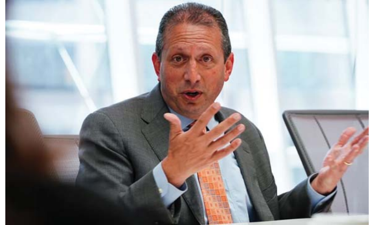
Brad Lander

New York City Comptroller Brad Lander announced he is running for mayor against Eric Adams, the latest Democrat to challenge the incumbent in a 2025 primary. The 55-year-old Lander, a frequent critic of the mayor, posted a video Tuesday morning questioning "leadership that delivers so little for so few."