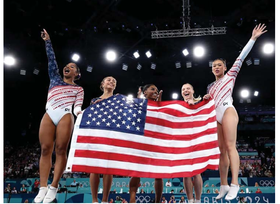
Jordan Chiles, Hezly Rivera, Simone Biles, Sunisa Lee and Jade Carey celebrate winning the gold medal during the Artistic Gymnastics Women's Team Final at the Olympic Games Paris 2024 on July 30.