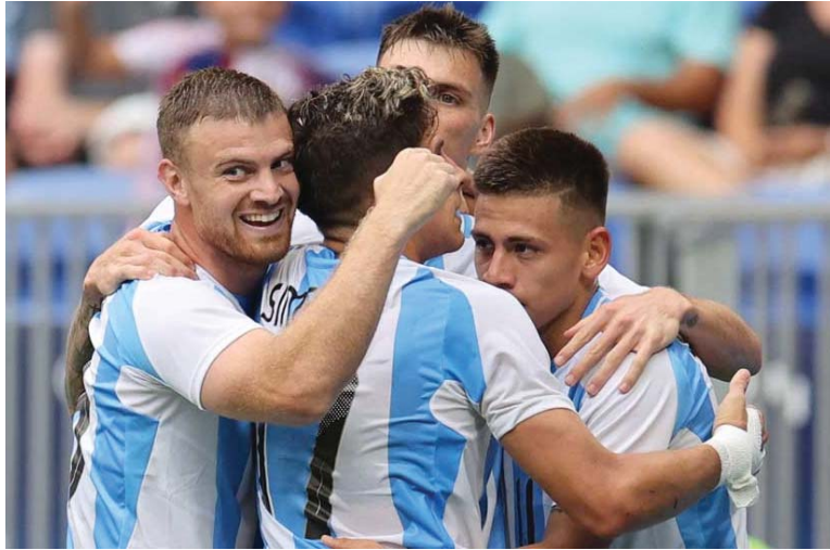
Paris 2024 Olympics - Football - Men's Group B - Ukraine vs Argentina - Lyon Stadium, Decines- Charpieu, France - July 30, 2024. Claudio Echeverri of Argentina celebrates scoring their second goal with teammates.