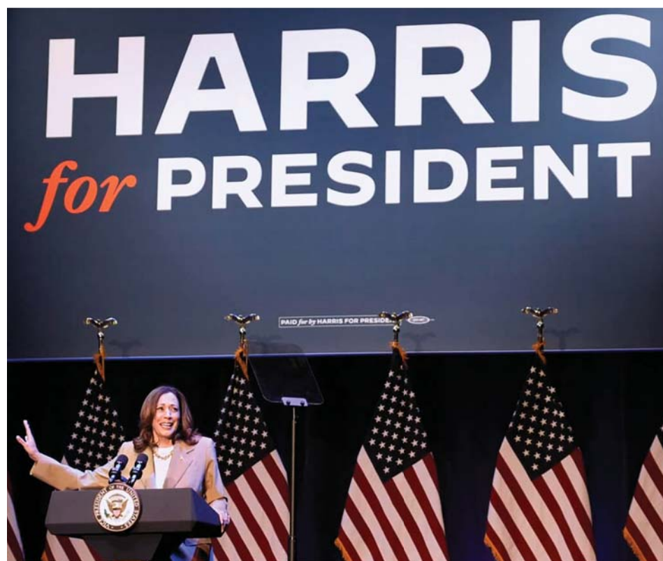
US Vice President and Democratic presidential candidate Kamala Harris speaks during a campaign fundraising event at the Colonial Theater in Pittsfield, Massachusetts, on July 27, 2024.

"We have a brand new victim," he told his cheering supporters. Source: AFP