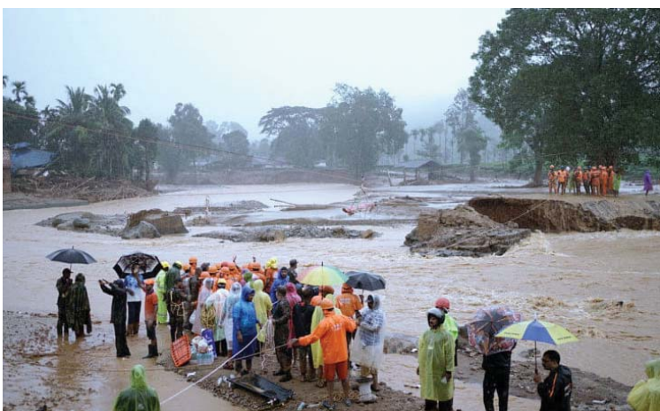
Southern state of Kerala, India, July 30, 2024

International Desk: The death toll rose to 93 in the deadly landslides triggered by heavy rains in hilly Wayanad district of India's Kerala today, PTI reported quoting state government sources.