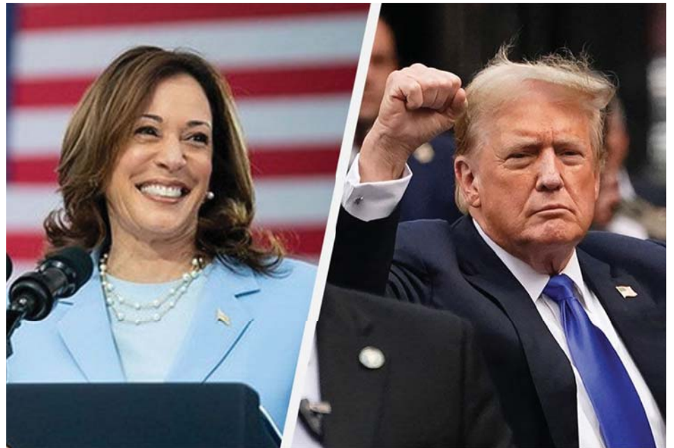
US Vice President Kamala Harris and Republican nominee Donald Trump.

The Ohio Republican, a graduate of Yale Law School who styles himself as a blue-collar hero, was chosen for his