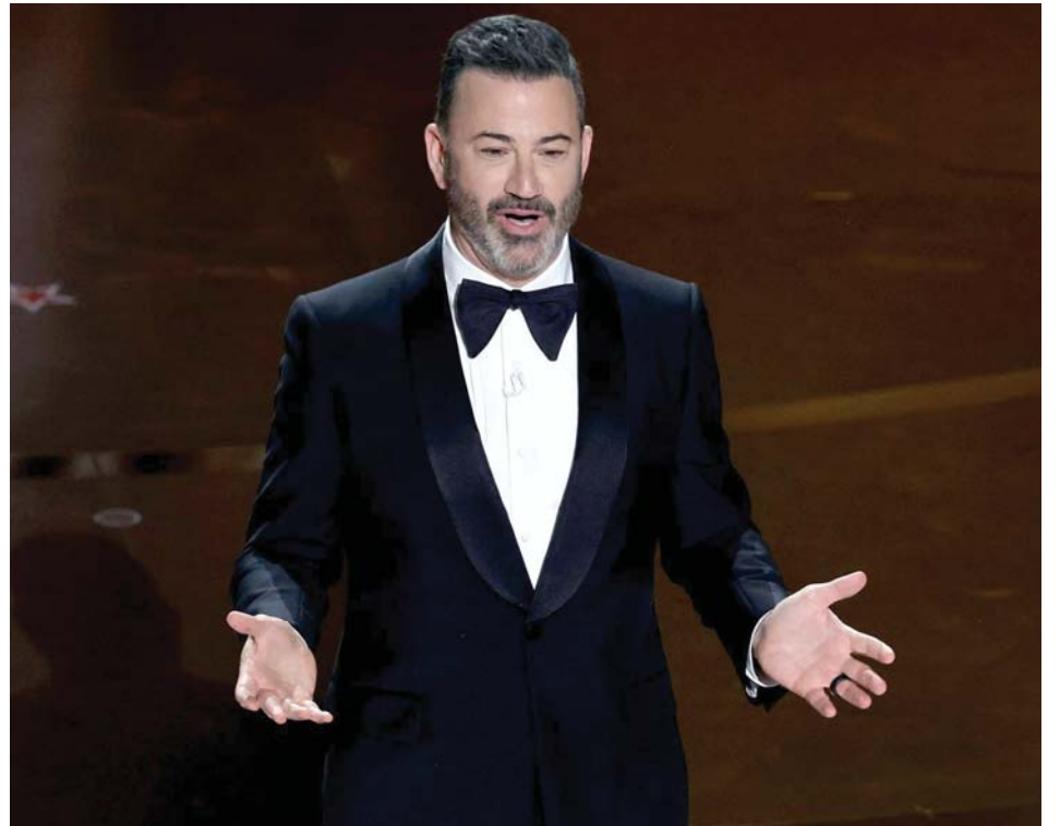
Jimmy Kimmel hosting the Oscars on March 10, 2024.