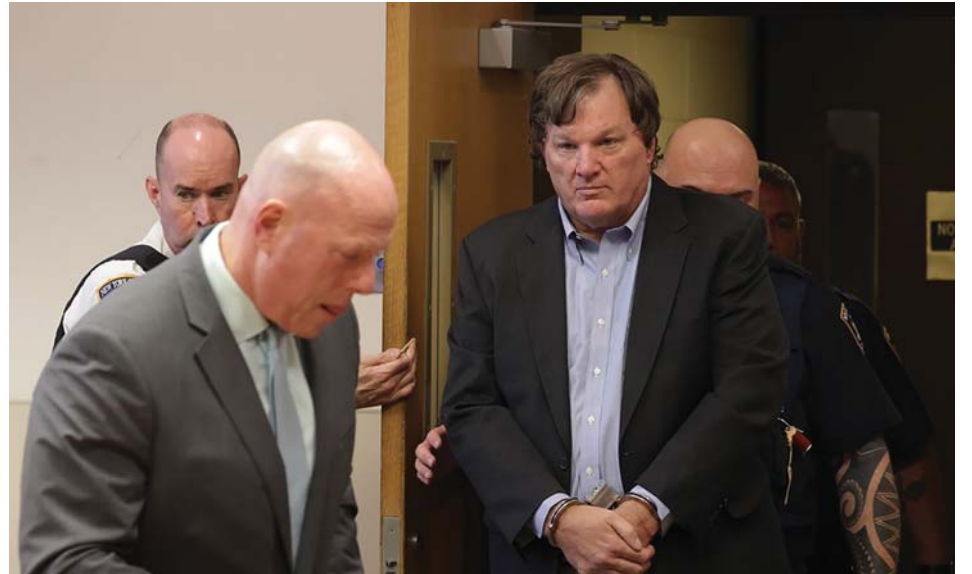
Suffolk County DA says Heuermann says they have expanded their investigation beyond Gilgo Beach.

LONG ISLAND: Alleged serial killer Rex Heuermann is due back in court on Long Island on Tuesday, pending additional evidence.