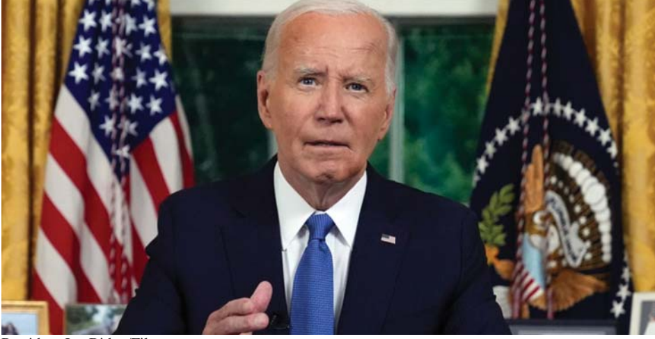
President Joe Biden/File

US President Joe Biden yesterday announced plans for urgent reforms to the conservative-dominated Supreme Court, in a bold but long-shot move as he seeks to make a mark in his last six months in power.